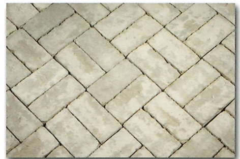
Polar White Clear