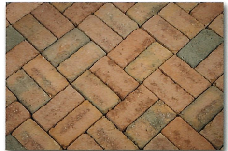
St. Anne Blend